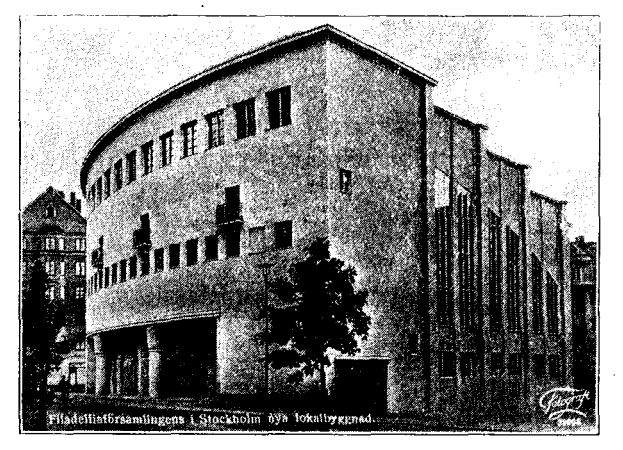
Newly Constructed Pentecostal Church in Stockholm, Sweden.

The building enterprise, of which pictures of the exterior and interior accompany this article, begun and carried on in faith to so notable a conclusion, would, however, be greatly minimized were it not for the fact that from its inception the work has been signally blessed of God and truly honored of Him in broadcasting the full